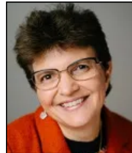
Chief Executive International Children’s Palliative Care Network (ICPCN) and Honorary Professor Makerere University, Uganda

https://doi.org/10.1016/S2352-4642(25)00338-4